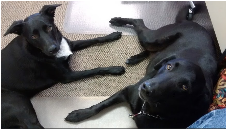
Rei and Peaux