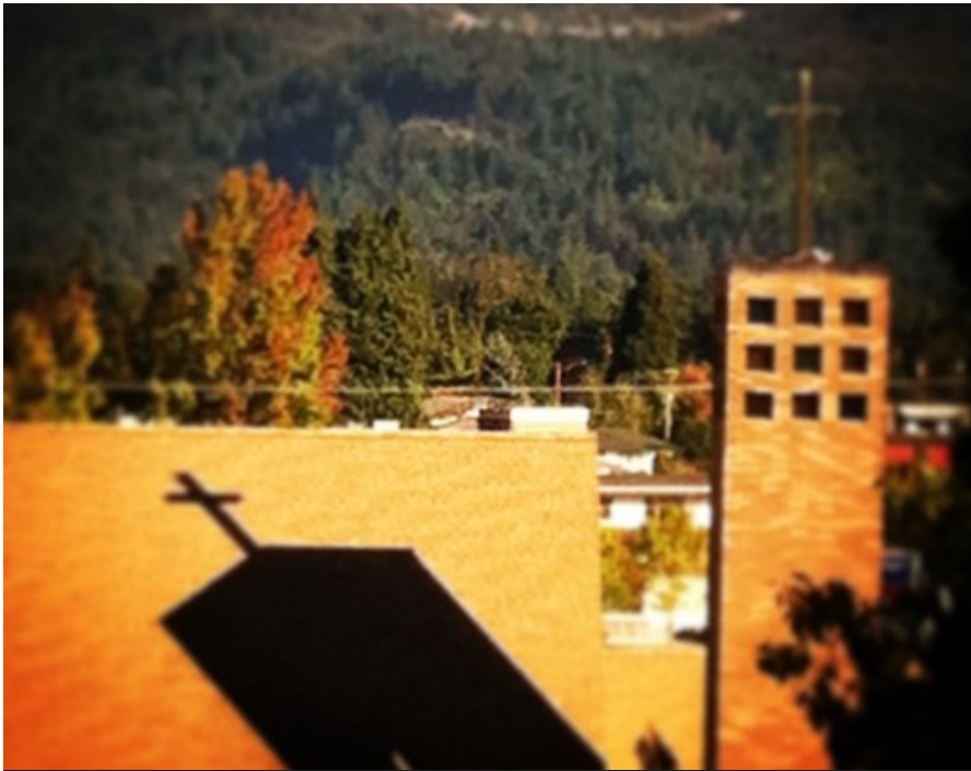
The SLC Steeple