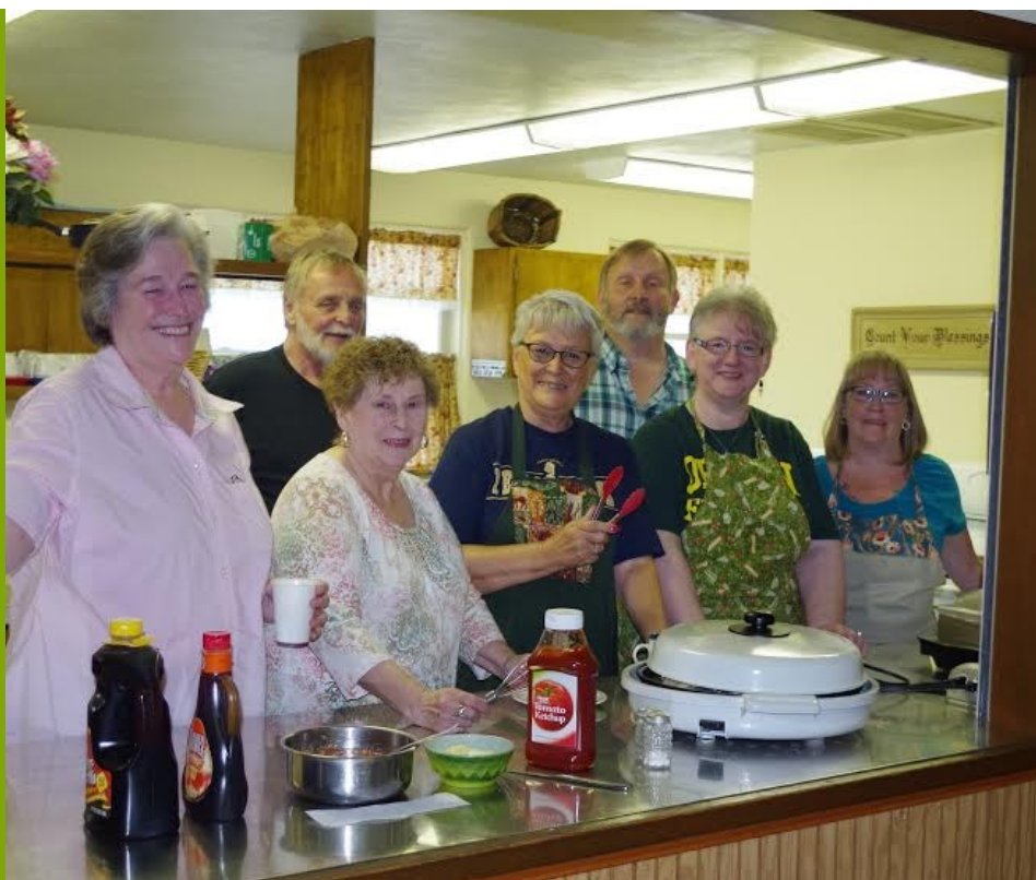
The Breakfast Club

Lutheran World Relief 700 Light Street Baltimore, MD 21230